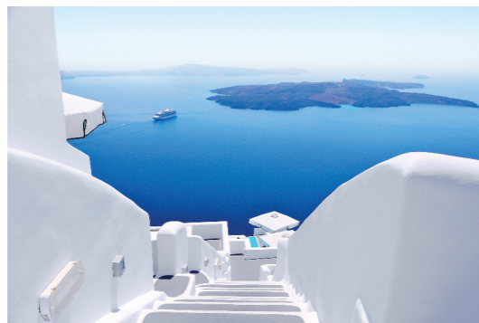
Santorini Island, Greece